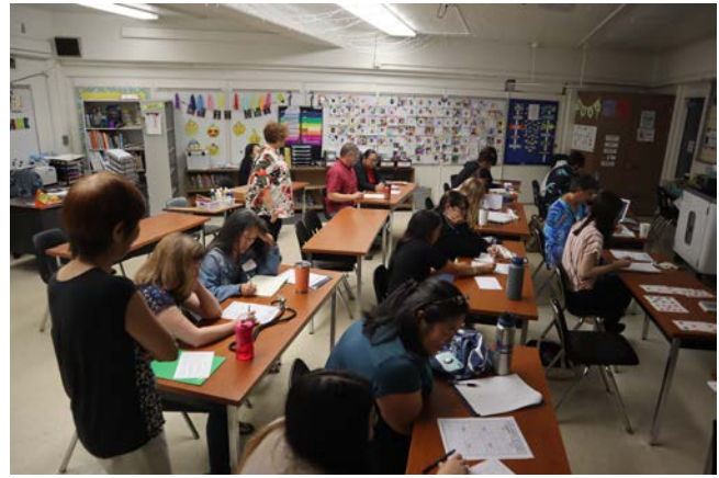
Using the Explorations worksheets and games to promote number sense.