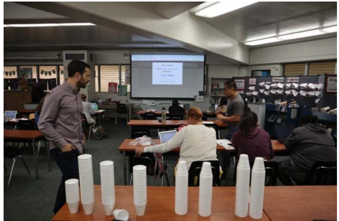
More Desmos action.