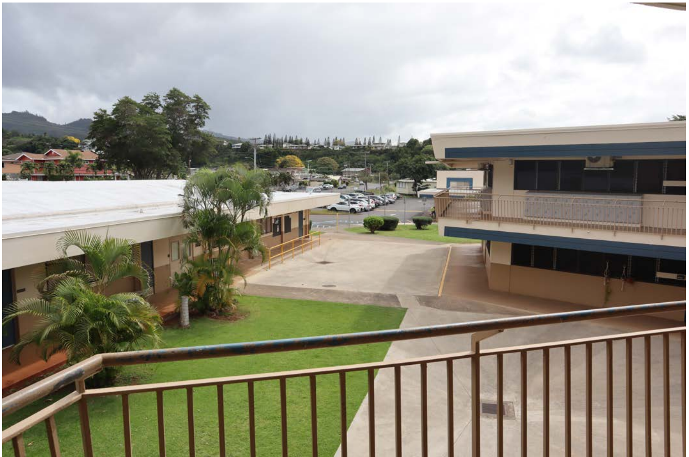
One section of the beautiful Moanalua Middle School campus.